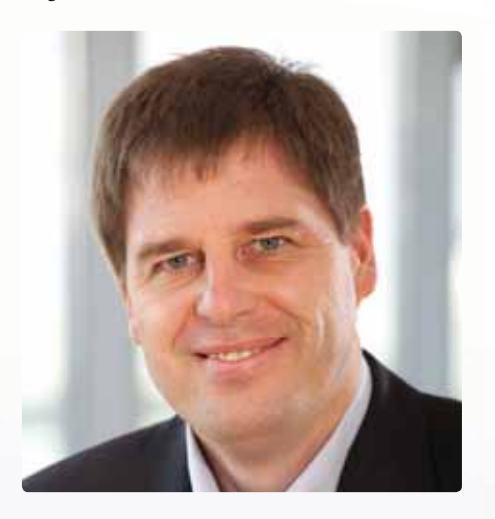
How have European frameworks evolved over the years to consider the importance of marine microbes? In order to fully integrate Micro B3, what additional policy is needed?

Intense regional and Europe-wide PR work will accompany this event. An open call to select the best additional sites is envisaged in 2013/14.