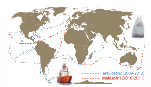
FIGURE 2. Overview of the Tara Oceans and Malaspina circumnavigation cruises © by B Garriz, E Broglio and JM Gasol.

Since Micro B3 is likely to bring about the discovery of new biotechnological applications for marine microbial data, there are complex issues of intellectual property involved, particularly given that much of the data gathered originates in exclusive economic zones or areas of ocean completely beyond any national jurisdiction. Micro B3 has a strong focus on open access and on involving all interested stakeholders in a non-exclusive way, with a view to future applications of marine diversity research.