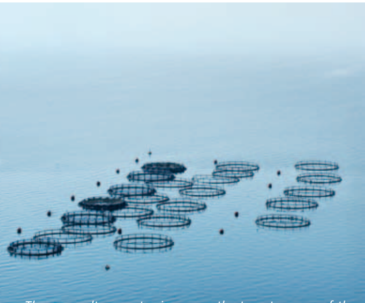
The aquaculture sector is among the target groups of the "Marine Genomics for Users" project

The ultimate objective is to learn from marine diversity – from fishing bio-active molecules to cultivating organisms and maybe soon synthesizing genes – to decipher and apply novel functions found in the marine environment.