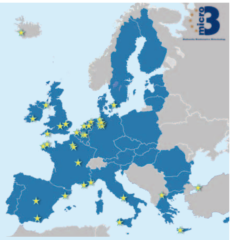
Figure 2: Map of geographical distribution of the 32 partners of Micro B3 large collaborative project